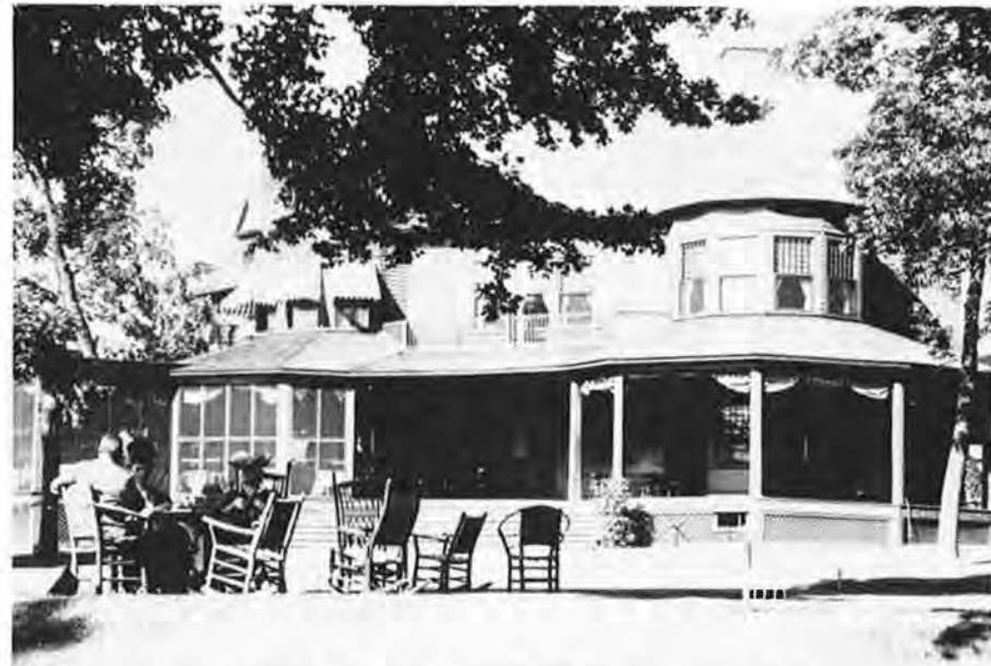
TOWN & COUNTRY CLUB . . . . 1887 Birthplace of golf in Minnesota

Golf moved from the society page to the front page in 1913 when Francis Ouimet, a 20-year-old amateur, won the National Open over the great English professionals, Harry Vardon and Edward "Ted" Ray, in a playoff at The Country Club in Brookline, Mass. The first Open victory by an amateur stunned the golf world and no single event to that time did more to stir public interest. Within a short time those with only a passing knowledge of the sport began playing. Golf professionals from the British Isles poured into Canada and the United States to spread the teaching word. Minnesota was also the beneficiary of this migration. As the number of homebred professionals grew and many gifted amateurs decided to play for pay, the Professional Golfers Association of America (PGA) was founded in 1916. A year later the Minnesota PGA came into being and launched the State Open at Minikahda. Except for 1931 the tournament has been held annually.