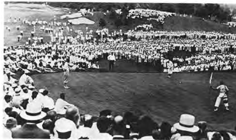
BOBBY JONES STROKES WAY TO IMMORTALITY