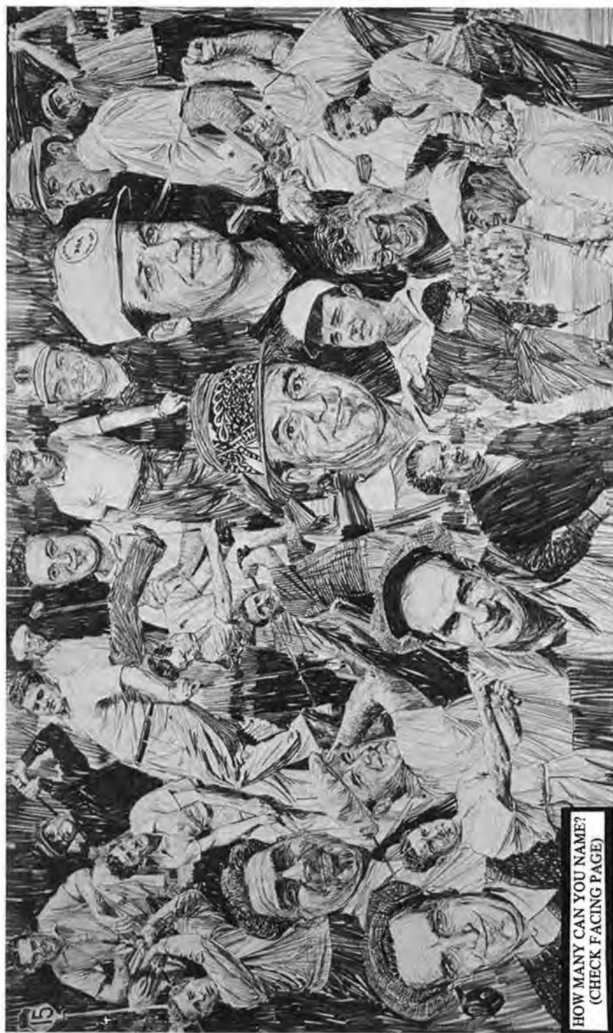
HOW MANY CAN YOU NAME? (CHECK FACING PAGE)