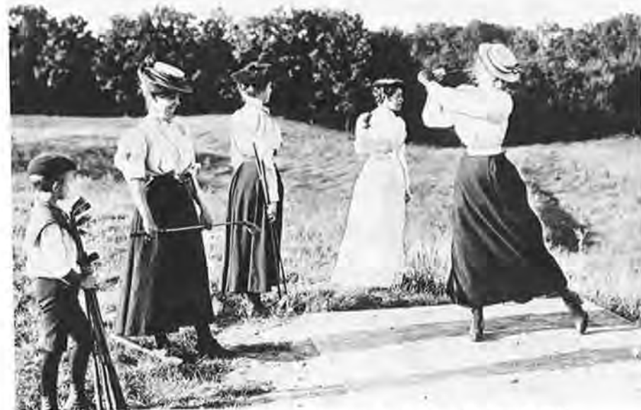
WOMEN PLAYING BRYN MAWR AT TURN OF CENTURY