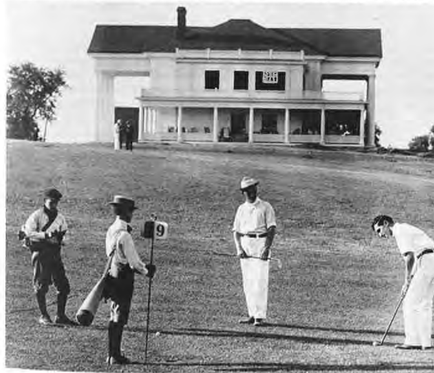
MINIKAHDA CLUB . . . . 1898 Hosted Second MGA Amateur 1902

Golf in Minnesota was firmly established by the late 1920's. Tournaments conducted by the various state associations drew record entry lists, the MGA Ama-