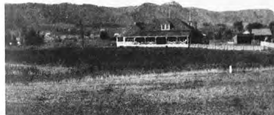
MEADOW-BROOK GOLF CLUB, WINONA (abandoned 1919) Site of First MGA Amateur Championship