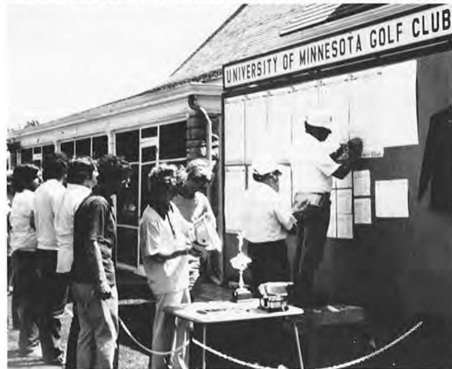
MGA OFFICIALS HARD AT WORK ON THE BIG BOARD Numbers—That's What Golf Is All About

We have tried to present a short history of the M.G.A. from its inception to the present. In doing so we have inevitably missed names, dates and important events that had a direct influence in the course the M.G.A. took at various times. The office is most desirous of receiving any and all news clippings, golf programs or other historical items that anyone might have that relates to our history. As time goes by, we hope to build a significant collection of memorabilia concerning our history