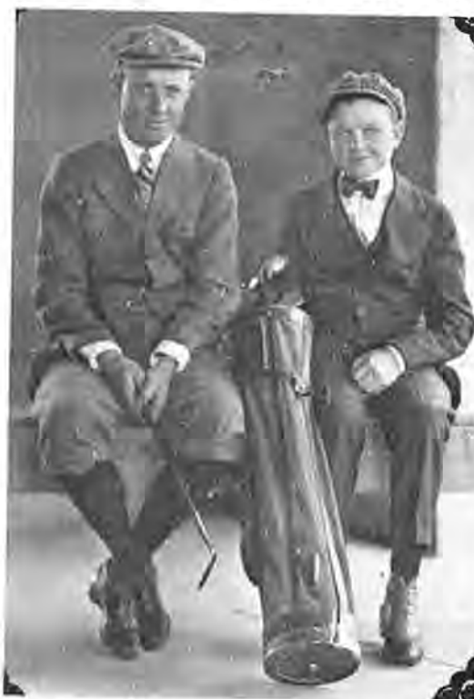
CHAMPION EVANS, HIS CADDY, 7 CLUBS

Evans' milestone is all the more remarkable because it was achieved not with a fat bag of clubs but with seven, yes, seven hickory-shafted sticks—a brassie (2-wood), spoon (3-wood), mid-iron (2-iron), jigger (chipper), mashie (5-iron), niblick (8 or 9-iron) and putter.