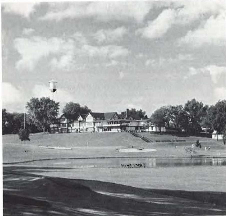
PLAYERS ARE IN, SCORES ARE FINAL, THE CONTEST IS OVER Interlachen CC (opened 1911). View of the lake toward ninth green