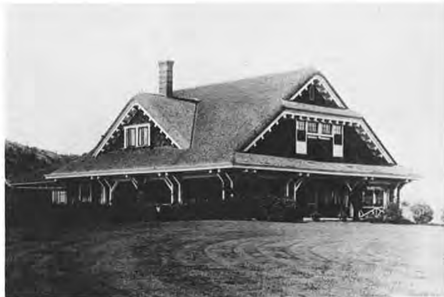
NORTHLAND CC, DULUTH . . . . 1904 Became 18-hole course in 1912, rebuilt 1927

teur at one point being broadcast on radio. Popularity intensified when Bobby Jones won the National Open at Interlachen in 1930. The annual appearance of the game's biggest names in the Keller Open kept the public golf conscious for nearly four decades. Moreover, exhibitions in Minnesota by top stars were successful. With the U.S. Open coming as early as 1916, Minnesota moved into the national forefront early and further demonstrated its leadership by frequently seeking big tournaments. That more than 40 came to this state is sufficient proof that these courses were of the highest quality. And enthusiasm always reached a high pitch when several Minnesota golfers won U.S. and regional championships.