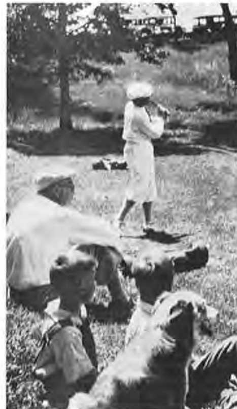
BOB JONES WAS EVERYBODY'S HERO

At St. Andrews on the famous 17th Road Hole, Jones' second shot to the green bounded into the gallery and, fortunately, the ball wound up just back of the putting surface. Again, it is conjecture as to where the ball might have stopped had it not been impeded. But a clutch putt halved the hole and kept him alive.